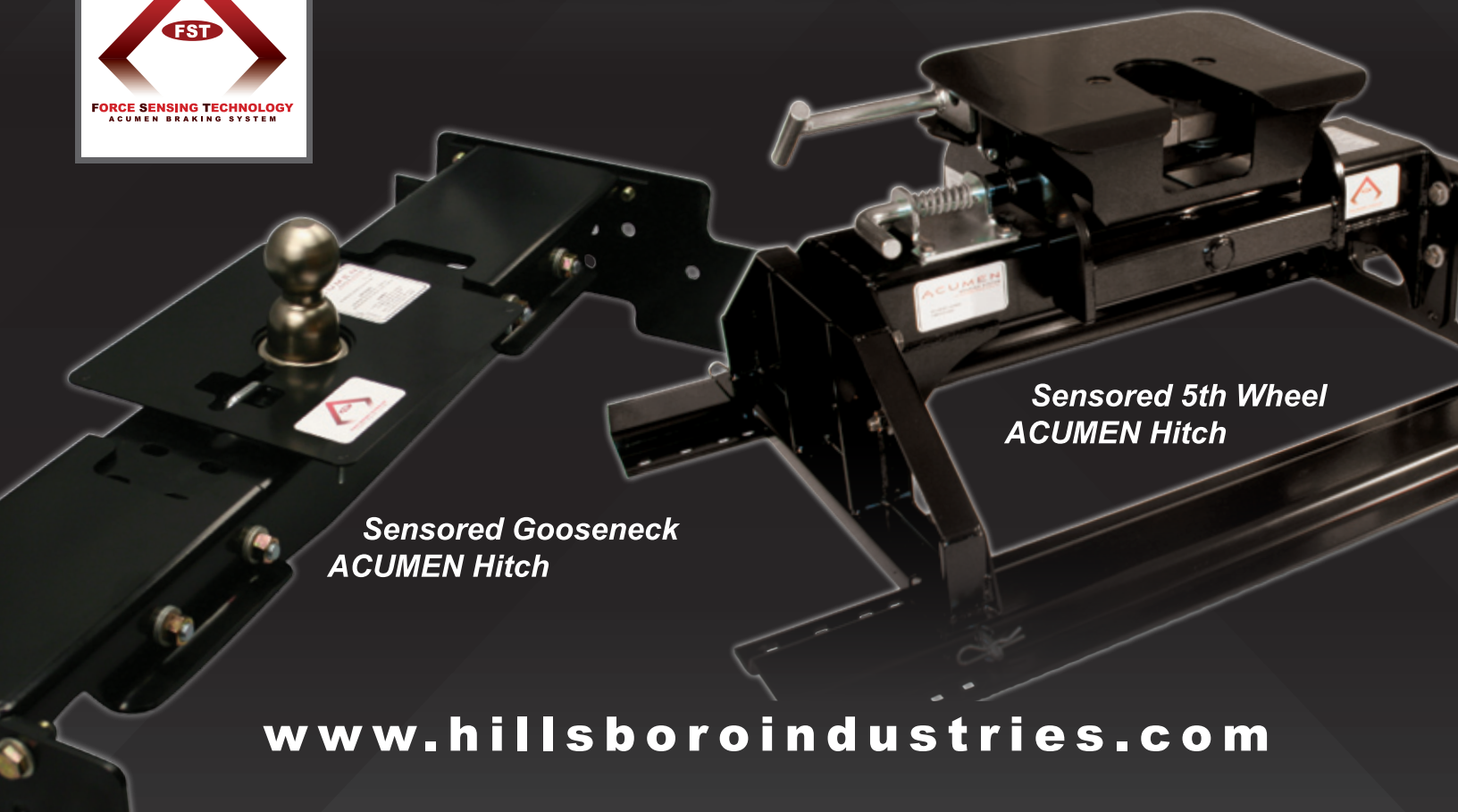
Sensored Gooseneck ACUMEN Hitch